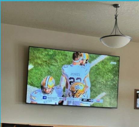
Cat v Griz Game 2025! At the Mission Bay Community Center!